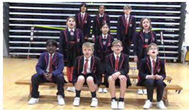
How to be an Independent Learner