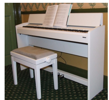
Our cool, new piano

piano lessons has been a constraint with all the competing activities in school. In the longer term, we aim to provide a newly constructed music area. In the meantime, we are using the nearest room upstairs, complete with a brilliant, white electronic piano, to provide Mrs. Williams with a dedicated space when other rooms are in use.