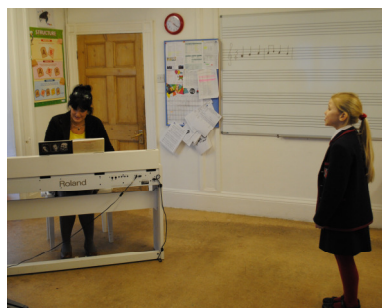
Our New Music Room

life. The class were keen to investigate how a light bulb works and made their own light using simple wires and batteries. The children also talked about the dangers of electricity and identified hazards found in the home.